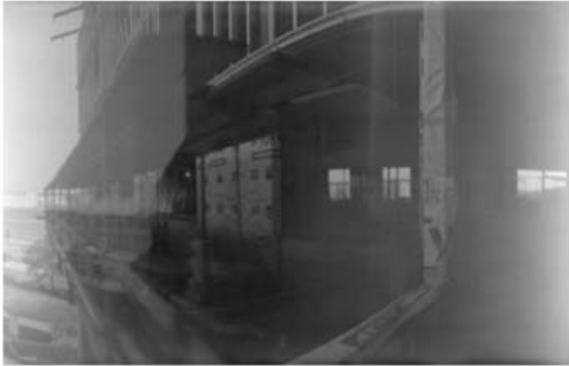
gelatin silver print pinhole photograph from a pinhole camera made from a paintcan 80 minute exposure